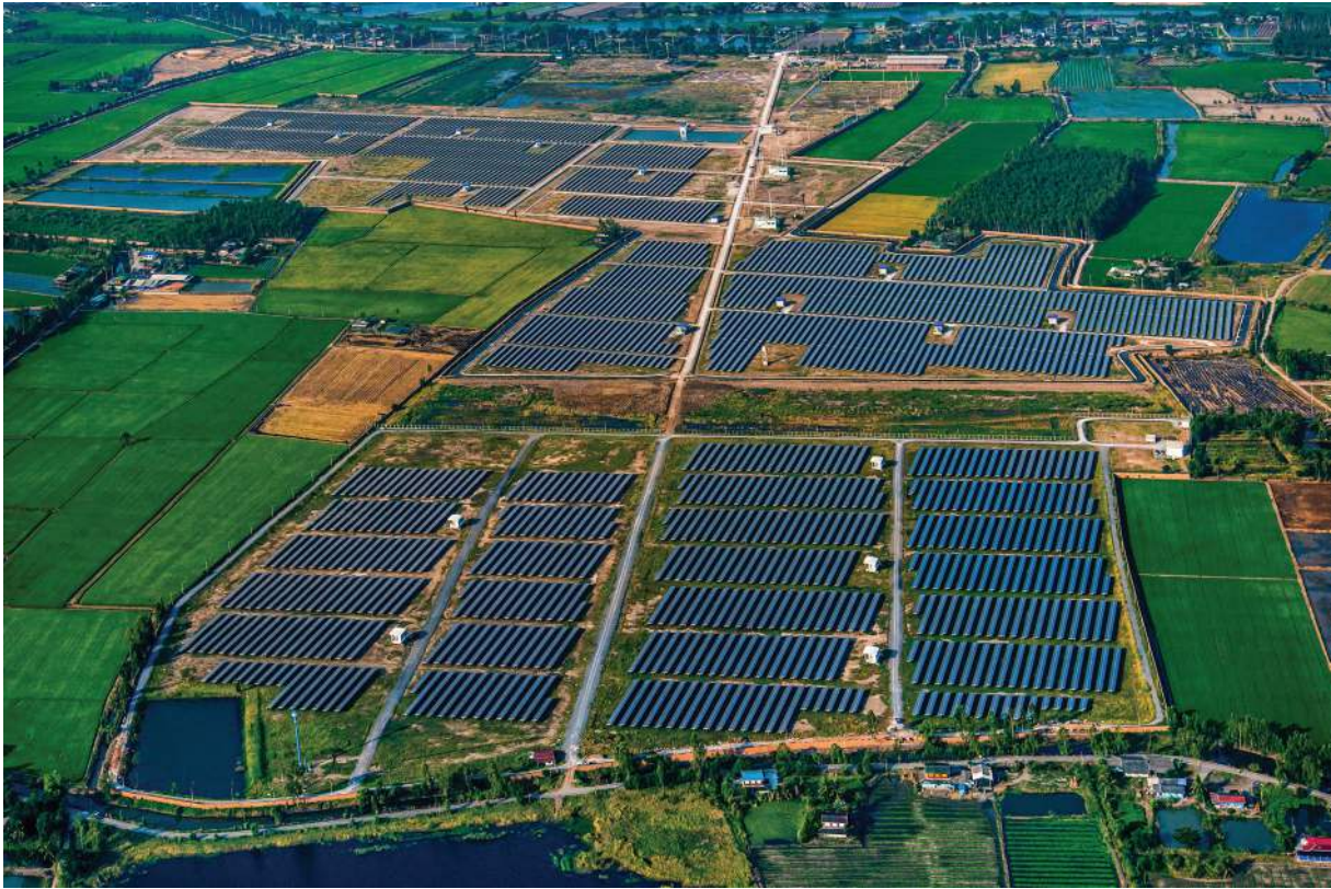
Fig. 4.3 for Question 4(c)