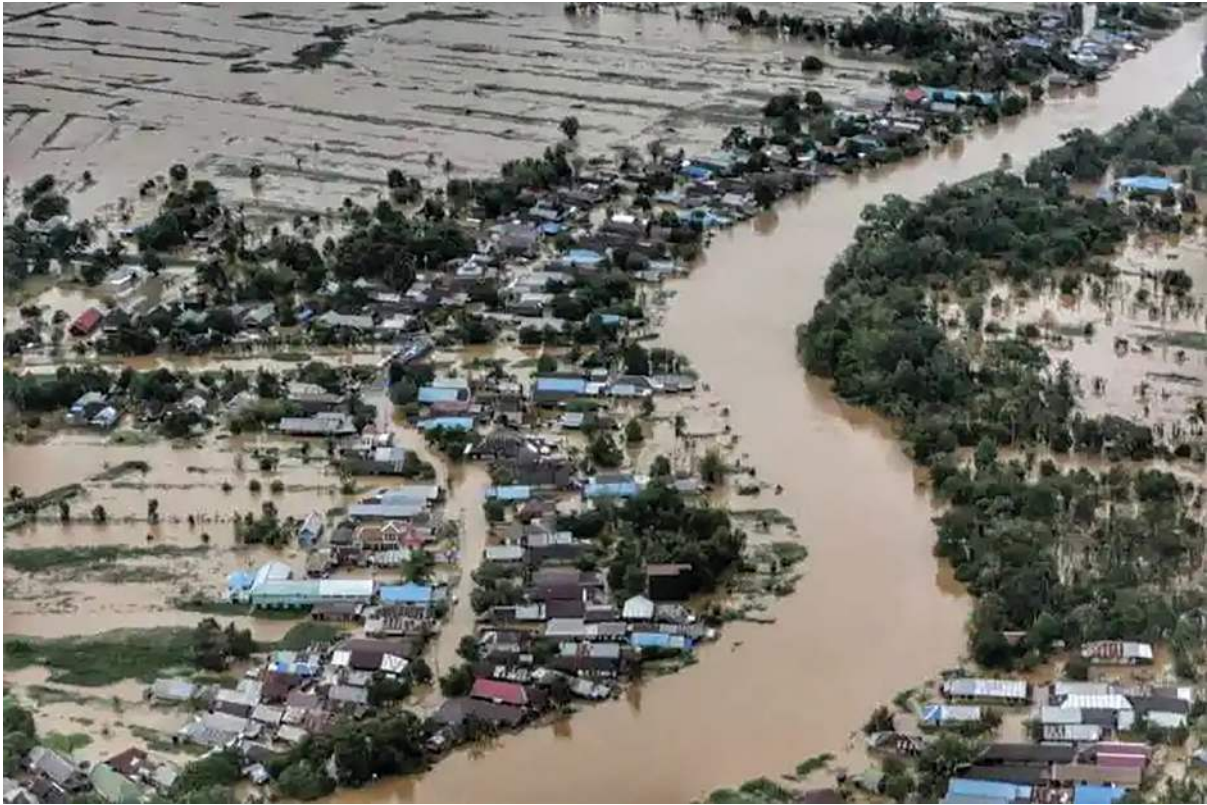
Fig. 3.2 for Question 3(c)