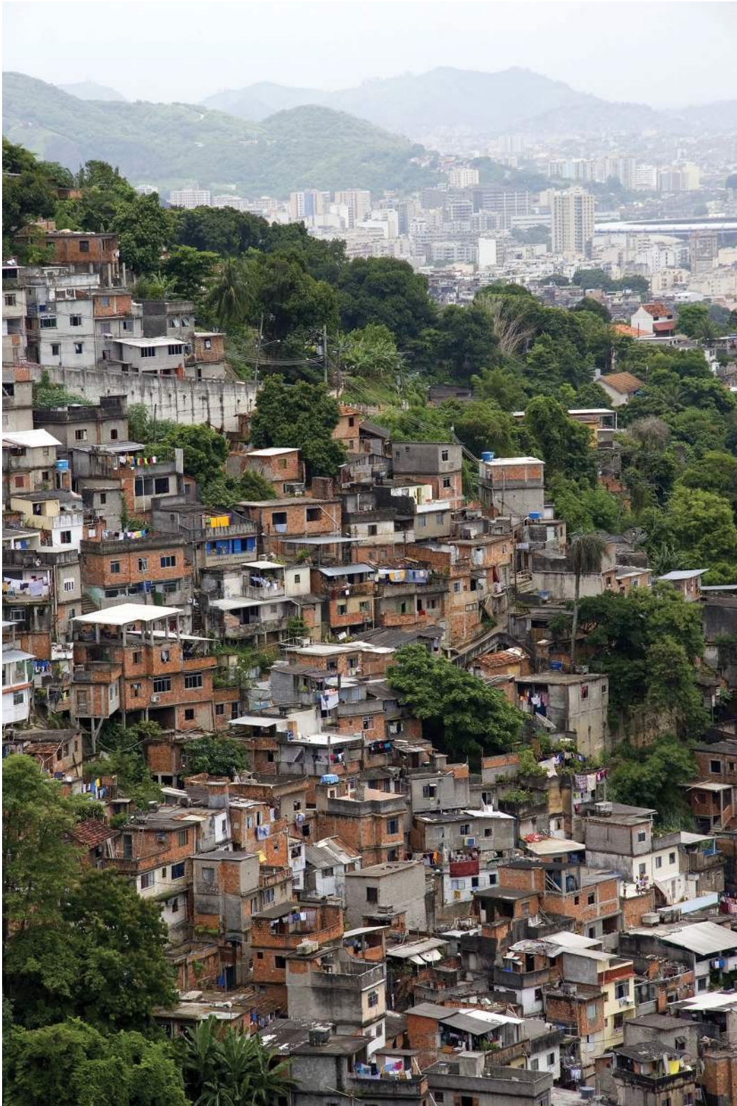
Fig. 6.2 for Question 6(b)